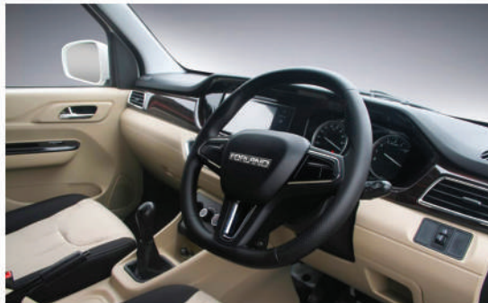
Stunning Electronic Power Steering