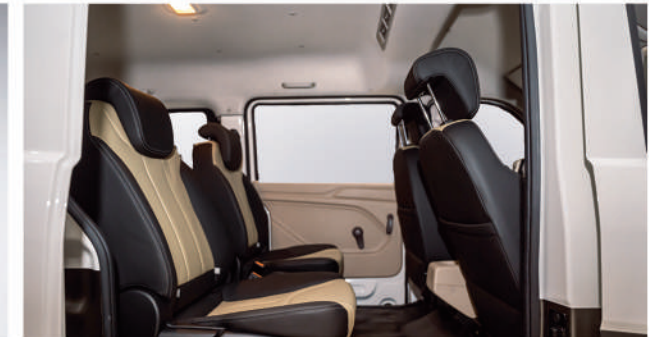
Comfortable & Matt Finish Chairs