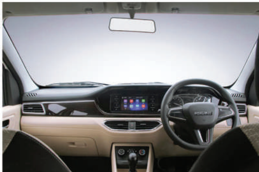
Wooden Trim with Gloss Finish